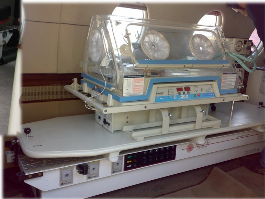
EXISTING FWD CABINET